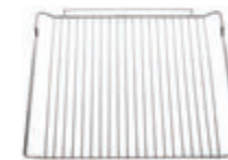
不銹鋼烤架（1個） Stainless Steel Grill Grate (1 pc)