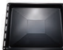
食物烤盤（1個） Food Deep Tray (1 pc)