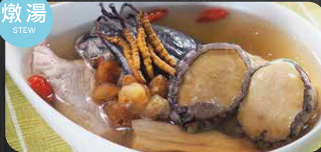
燉老火靚湯 Stewed Soup