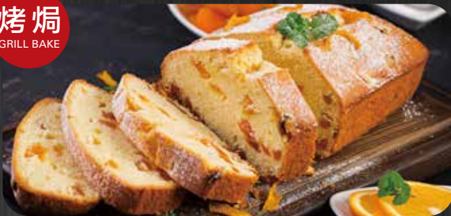
焗蛋糕麵包 Cake & Bread