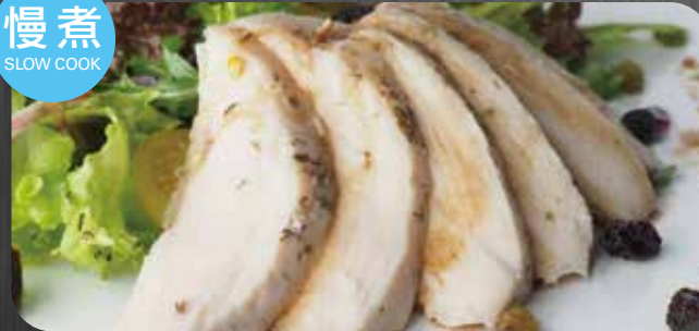
慢煮雞鴨胸 Poultry Breast