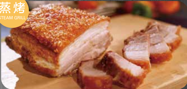
烤雞烤豬排 Chicken & Ribs