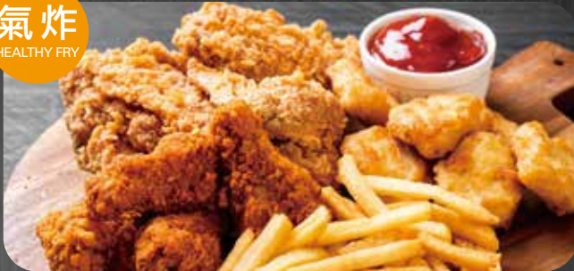
炸雞炸薯條 Wings & Fries