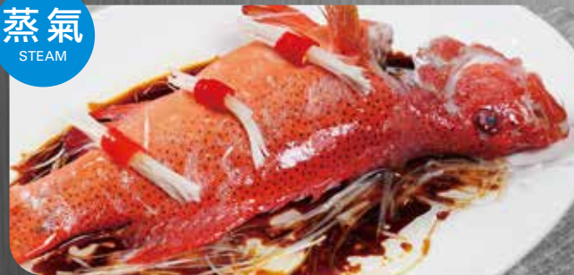
蒸魚蒸海鮮 Fish & Seafood